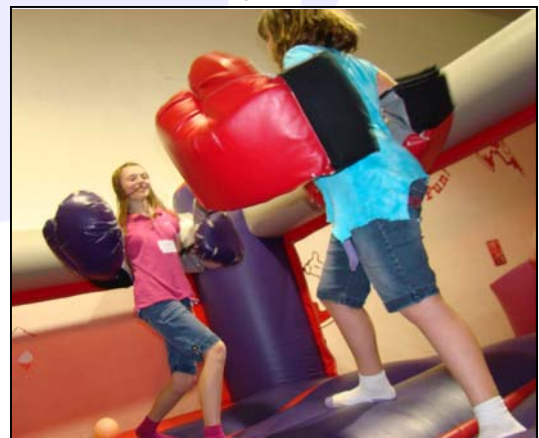
Sibshops pals have fun duking it out at Bounce U during our first 2010 session.

January 16th: Moms' Night Out. Barnes & Noble coffee shop, Friendly Center. 7 p.m.